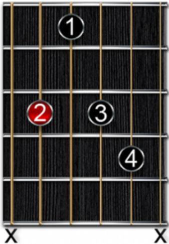
Position de Cm (acc. min #9)