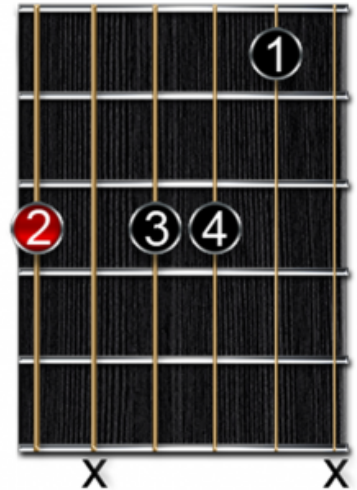
Position de Gm (acc. min11)