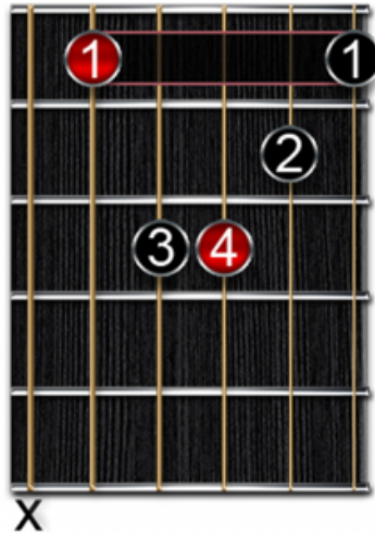
Position de Am